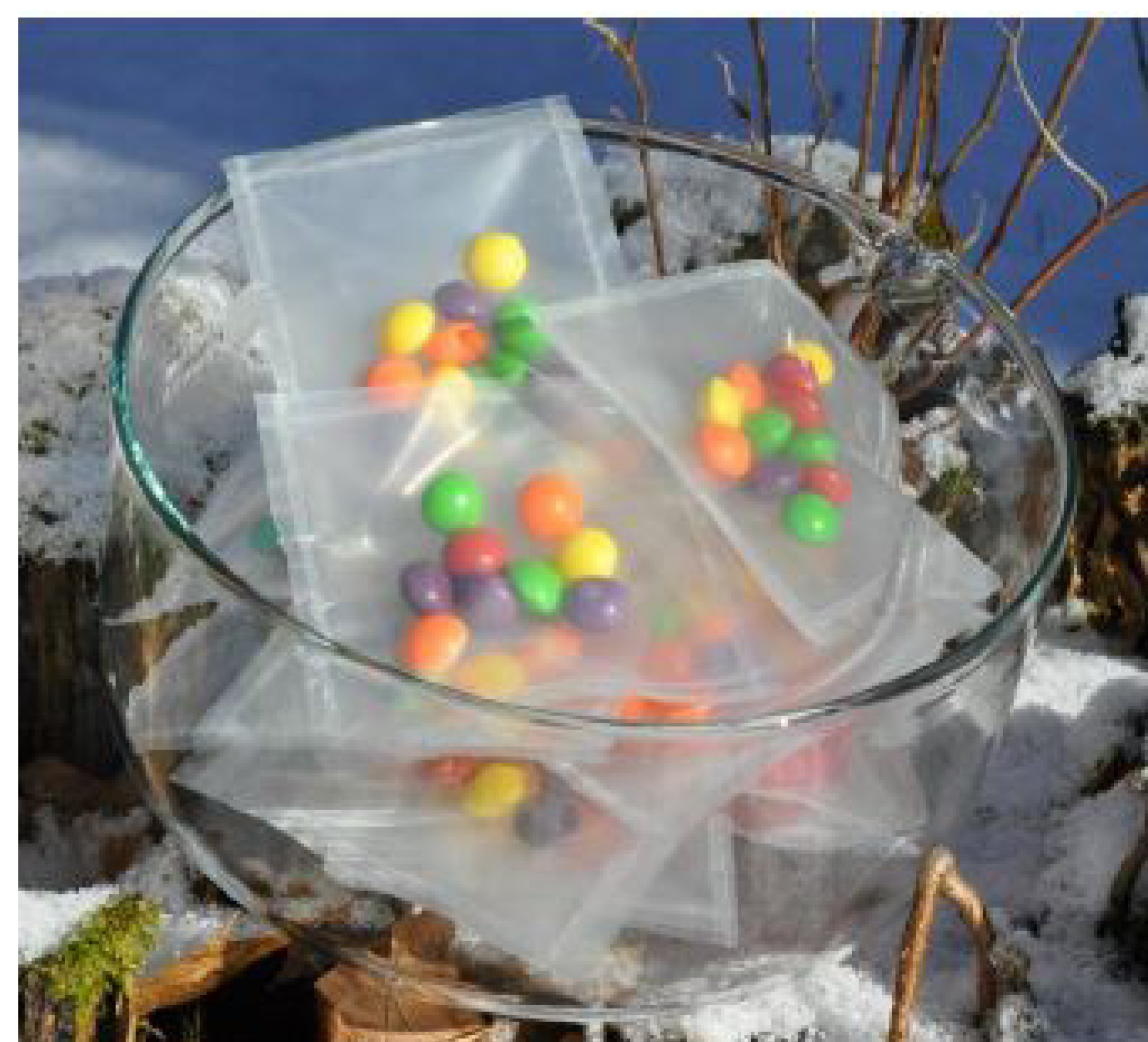
Figure 2. Three-layer cellulose film consisting of thermoplastic cellulose and HefCel CNF.

HefCel material has shown potential in many applications, such as in barrier films, as strengthening additive in middle ply of board and in novel type of energy storages. One novel application utilizing the excellent oxygen, grease and gas barrier properties of cellulose nanomaterial films is an all-cellulosic packaging material from HefCel and fatty acid esters. It is a 3-layer barrier film structure consisting of two layers of thermoplastic cellulose with a HefCel film layer sandwiched in-between. Thermoplastic cellulose films act as moisture and water vapour barrier as well as enables heat sealing. The material is 100% renewable, recyclable and processable with existing machinery (Figure 2).