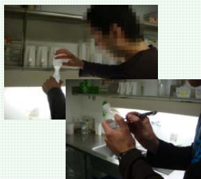
Above: A parent to an inpatient premature baby in the process of transferring the mother's breastmilk into an individualized receptacle for storage, and marking it for future identification before storing in the milk kitchen refrigerator.

professionals (see images below). The original scope and framing to re-design refrigeration units per se , were opened up through the collaboration to scrutinizing, but also leveraging, breast milk handling practices across the entirety of 'the journey' of the breast milk - the 'hands', the props, and situations, all which bear upon its handling. It broached more than what may reduced to patient safety in a clear-cut manner - and reframed the issue more conductively as manifold practices in many different situations of potential pertinence to quality in breast milk handling. Design materials issuing from this process allowed for actively