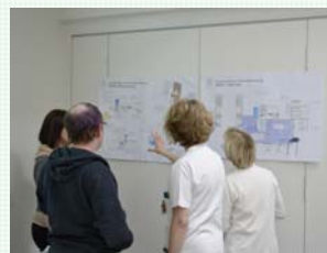
Below: Image taken from one of the co-design sessions between hospital personnel and university project team with design engineering students - in generative design research and qualifying solutions.

engaging participants in hands-on co-design processes. Ethnographic research findings, reframing problem focus as well as opportunities toward improvement, were followed by ideation, and concept detailing, resulting in three distinct holistic proposals. While the proposed solutions were