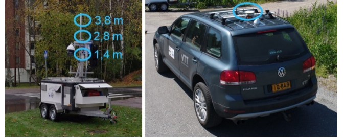
Fig. 4. Variable antenna height installations in C-V2X trials. Roadside installations (left); roof rack installations on test vehicle 'Marti' (right).

Development Platform. The used antenna in this setup were NMO4E5350 from PulseLarsen Antennas. The measurements conducted with three different antenna height installations on trailer: 1.4 meter, 2.8 meter and 3.8 meter. Such heights were chosen to represent the most common positions where a C-V2X antenna could be installed, being the average height of a vehicle, a roadside traffic light height and an over-the-road traffic light gantries height respectively. Test vehicle 'Marti' had a fixed height for all measurements, 1.8 meter. Both the test vehicle 'Marti' and the trailer 'Marsu' were equipped with the same hardware.