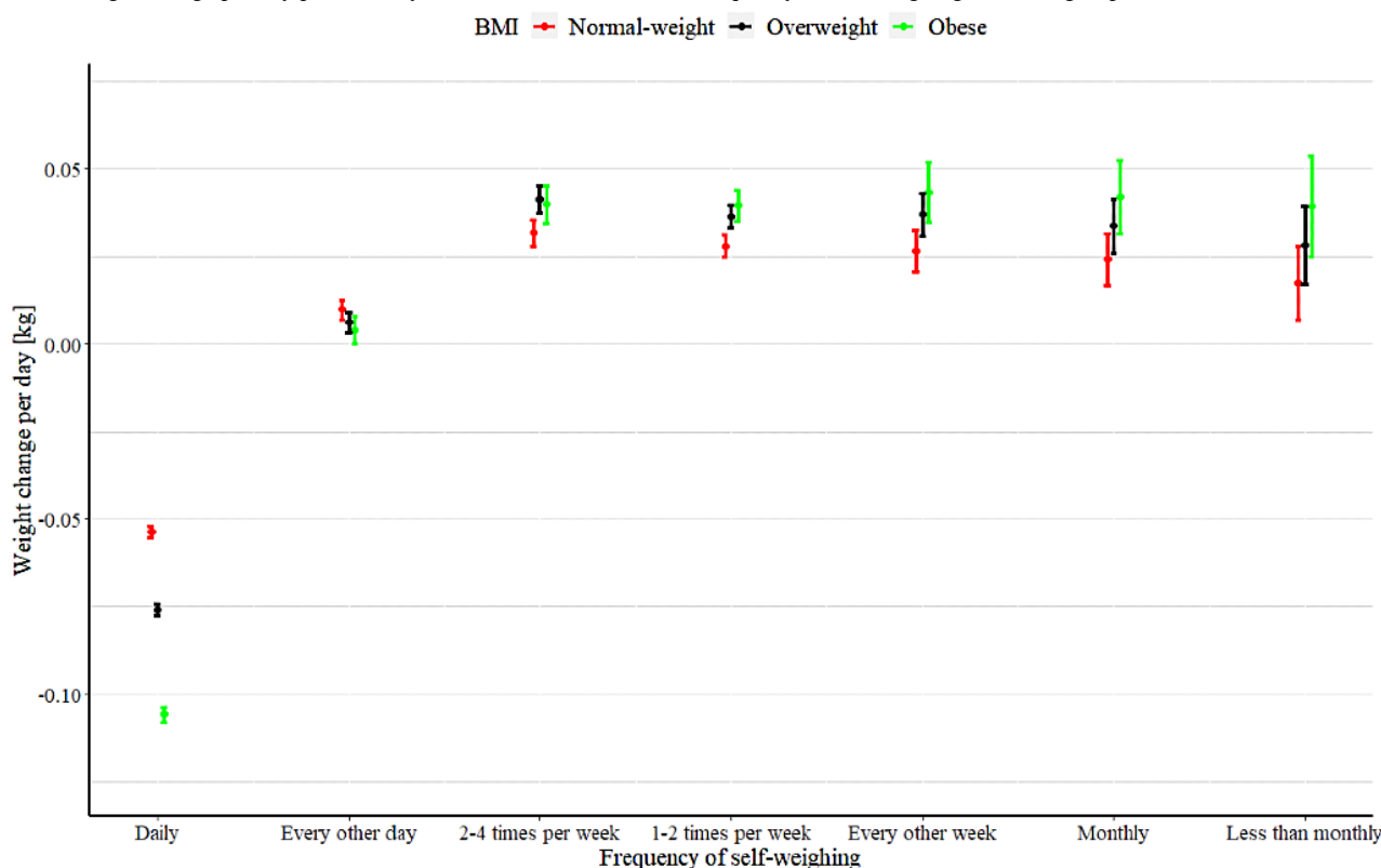
Figure 3. Weight change per day predicted by the interaction between the frequency of self-weighing and BMI group.