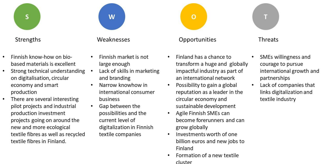
Figure 3. SWOT-analysis of the transformation in Finnish textile and fashion industry

Finland has excellent preconditions for transforming the textile industry as part of an international network. Additionally, partnerships, cooperation, research and development is needed to bring different industrial sectors together and finding the solutions towards sustainability and knowledge-based textiles and fashion. The strengths, weaknesses, opportunities and threats of this transformation is summarised in Figure 3.