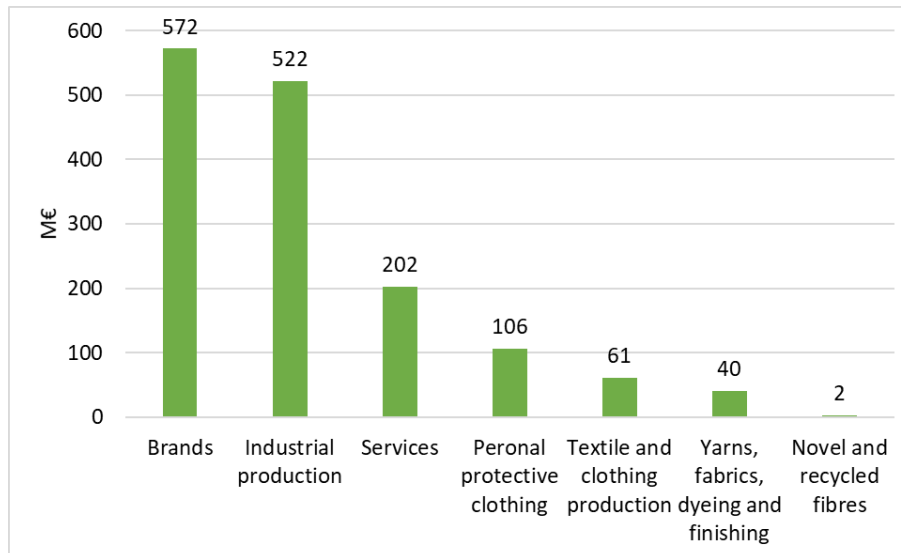
Figure 2. Turnover of different subsectors of Finnish textile industry. (Brands includes manufacturers of clothing, accessories and interior and home textiles, such as fashion brands that do not have their own production in Finland; Industrial production includes nonwovens, hygiene products, medical textile products and other technical textiles; Services includes rental, laundry and second-hand platforms; Personal protective clothing includes manufacture, wholesale and retail 9 ).

The manufacturing of textiles and clothing is the core of the Finnish textile industry. Broadly speaking, however, the textile and fashion sector in Finland covers a number of different actors and activities. In addition, the textile and fashion sector includes retail and wholesale of textiles and fashion, maintenance of textiles and fashion, and other manufacturing related to the industry, including shoes, leather goods, fiberglass and mattress. In 2019, the turnover of the whole textile sector was EUR 4.4 billion. 14 The turnover of selected subsectors of the Finnish textile industry is shown in Figure 2.